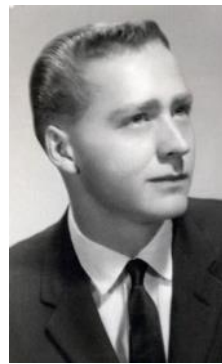
July 19, 1945 - August 3, 2024