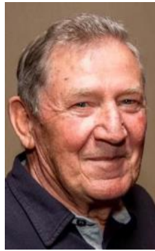
December 27, 1929 - March 11, 2021