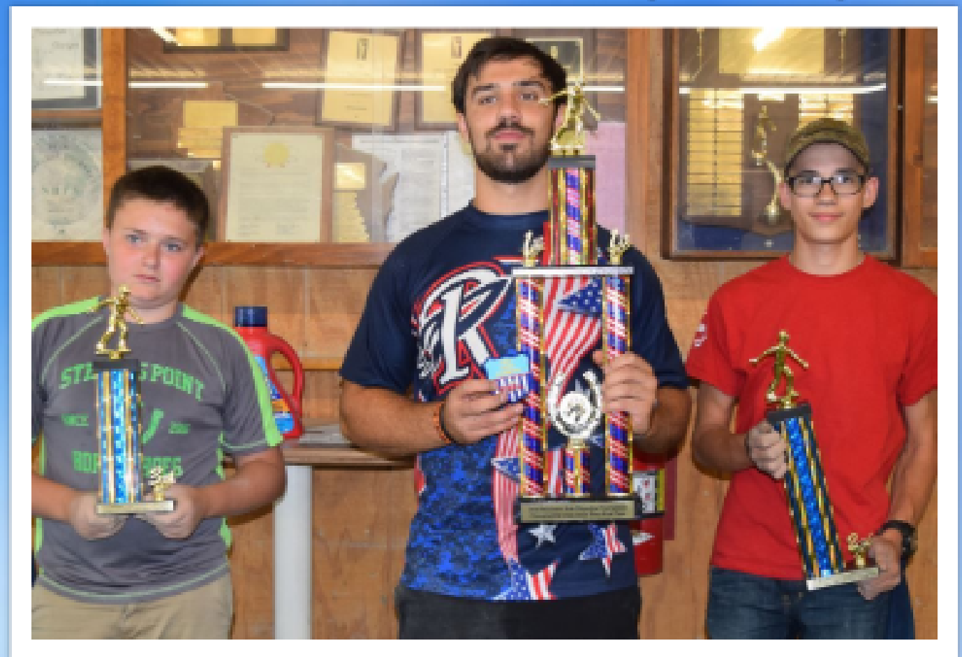
Jr Boys Championship