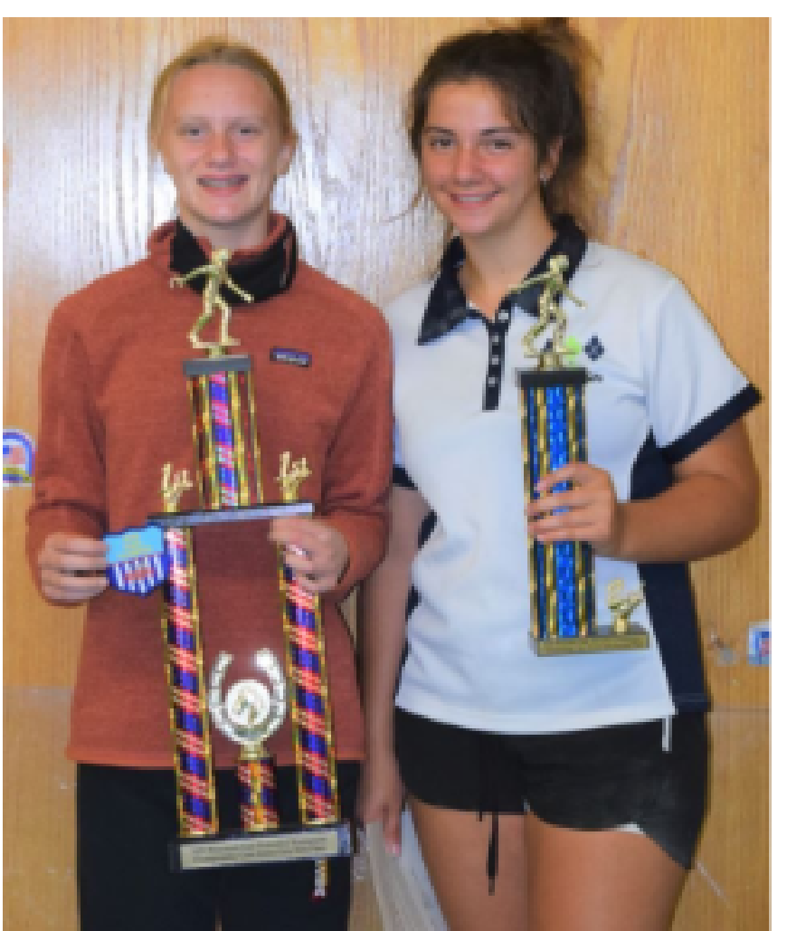
Jr Girls Championship