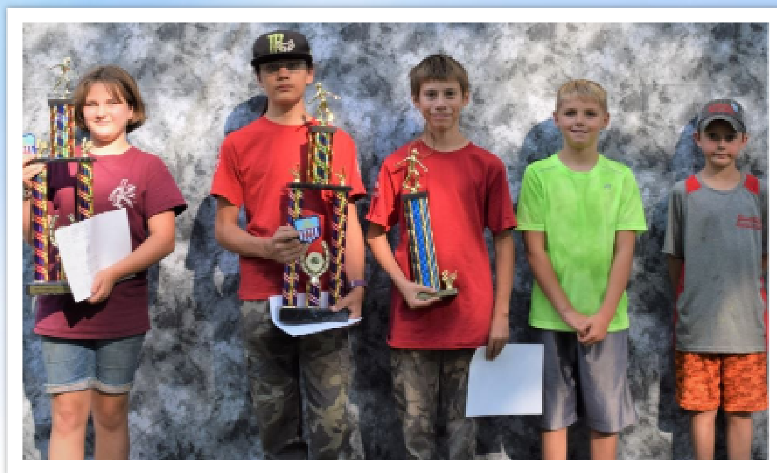
Cadet Boys and Girls Championship